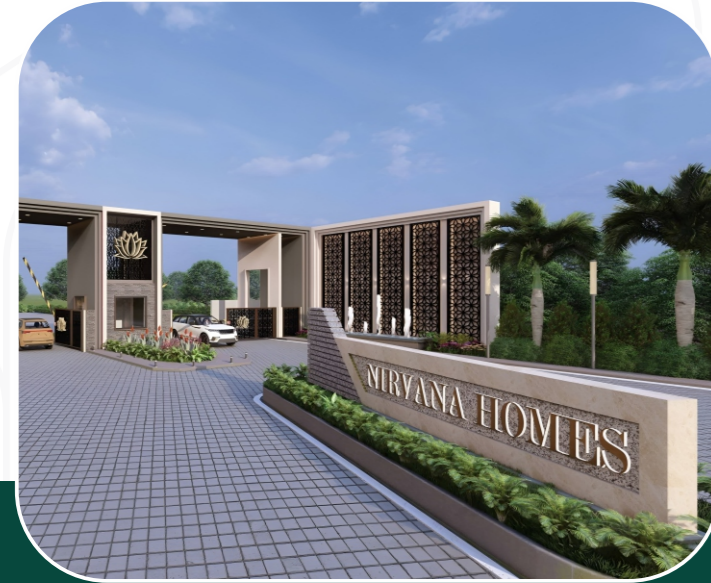
Nirvana Homes (Phase 1) Residential | Sector - 22, kaithal, Haryana