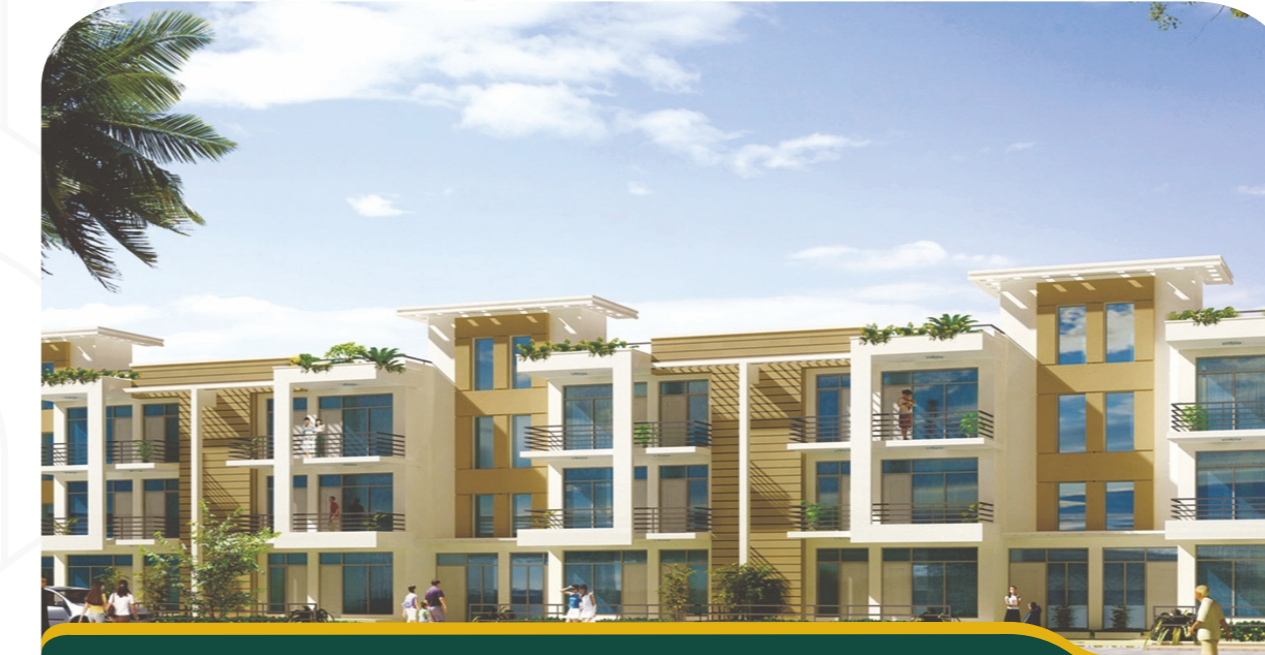
SHREE VARDHMAN MY HOMES Sector- 30, NH-1, Kurukshetra