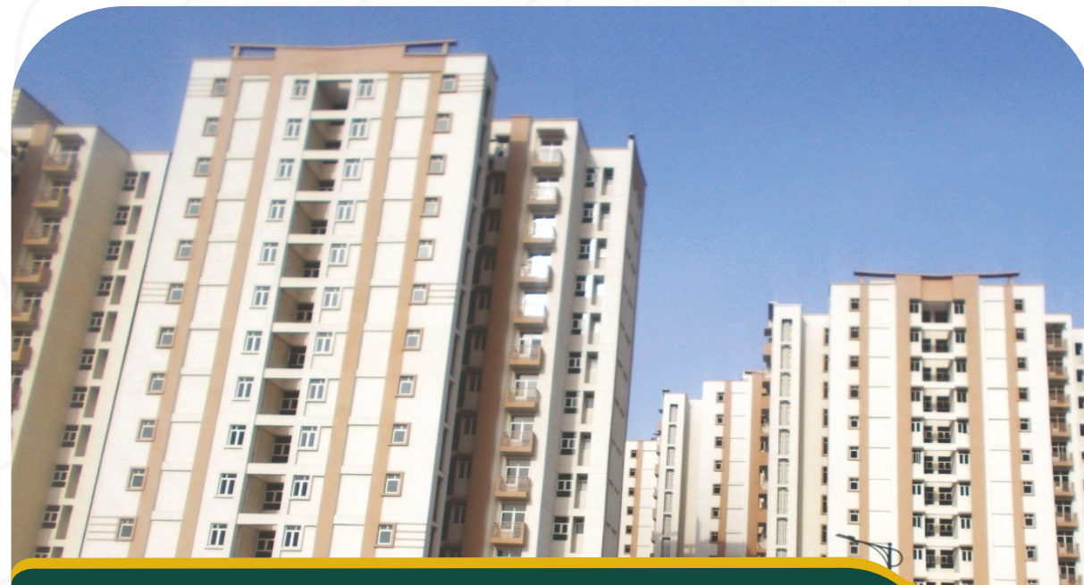
SHREE VARDHMAN MANTRA 11.26 Acres, Group Housing, Sector-67, Gurugram