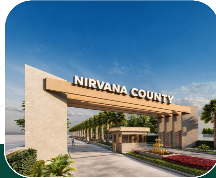
Nirvana County (Phase 1) Residential | Sector-22, Jind, Haryana