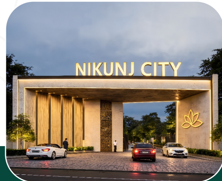
Nikunj City Residential | Sector - 91, Sonipat, Haryana (DDJAY)