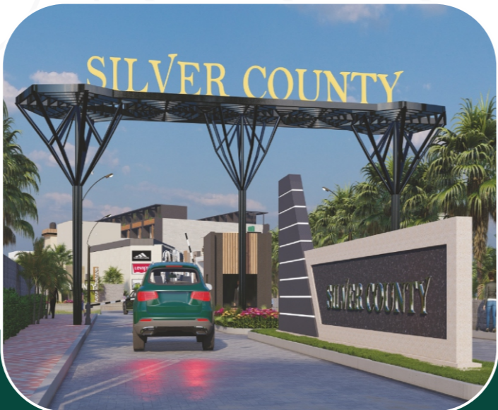
Silver County Residential | Sector - 95A, Gurugram, Haryana