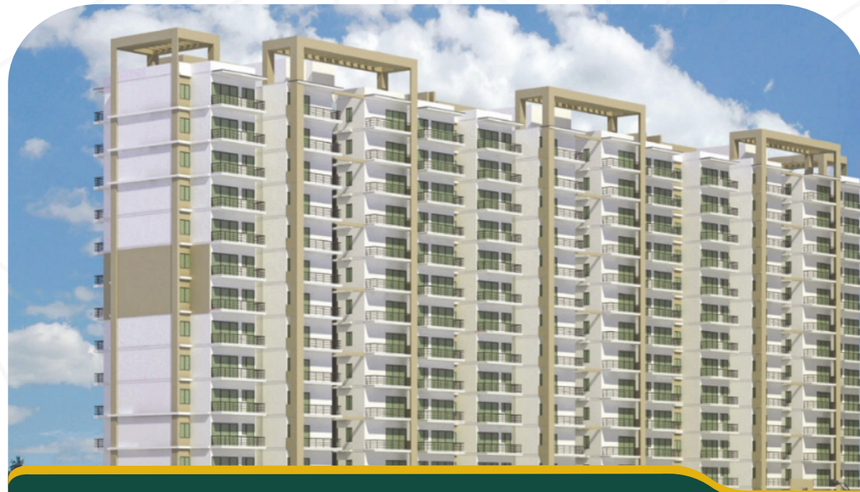
SHREE VARDHMAN GREEN COURT 10 Acres, Sector-90, Gurugram