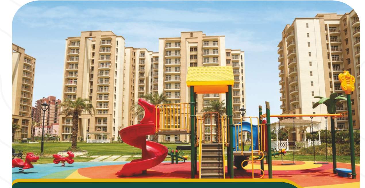
SHREE VARDHMAN GARDENIA 14 Acres, Group Housing, Sector-10, Sonipat