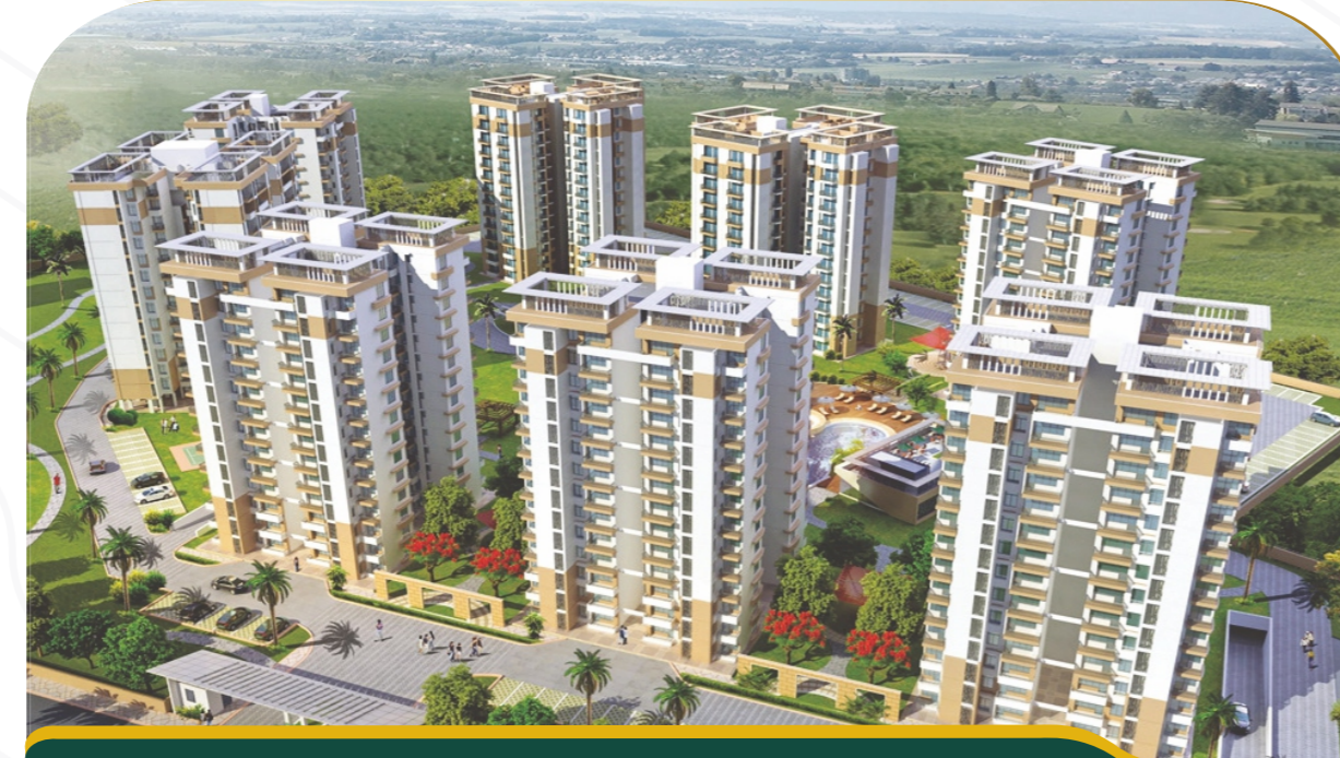
SHREE VARDHMAN FLORA 10.88 Acres, Group Housing, Sector-90, Gurugram