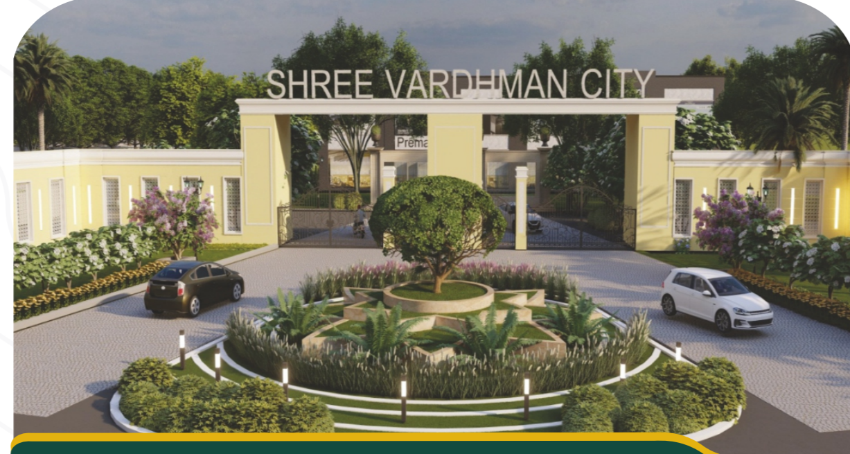
SHREE VARDHMAN CITY 10 Acres, Plotted Colony, Sector-2, Sohna Road, Gurugram