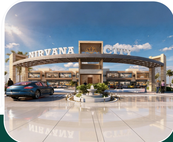
Nirvana City (Phase 1) Residential | Sector - 3, Road, Shahabad, Kurukshetra