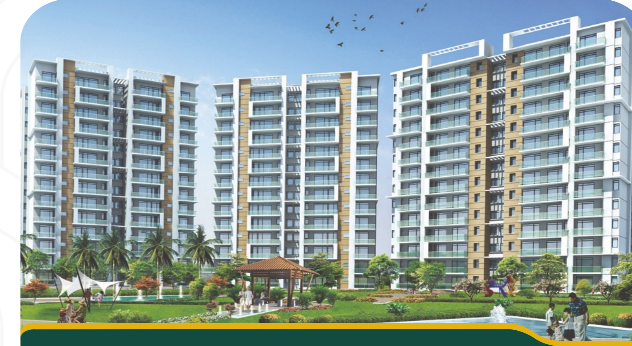
SHREE VARDHMAN VICTORIA 10.96 Acres, Premium Group Housing, Sector-70, Gurugram