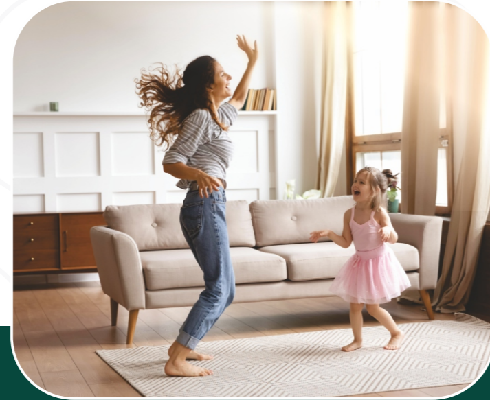
Nirvana City (Phase 2) Residential | Sector - 3, Road, Shahabad, Kurukshetra (DDJAY)