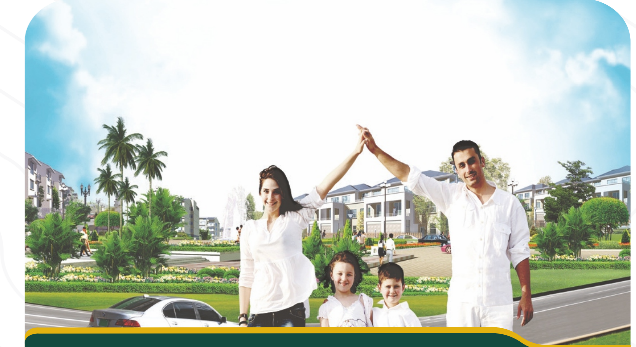
SHREE VARDHMAN CITY 50.125 Acres, Premium Group Housing, Sector-70, Gurugram